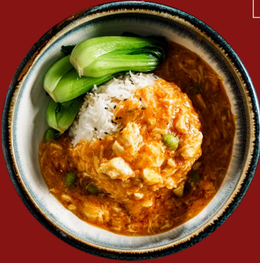
Rice with Crab Meat Sauce