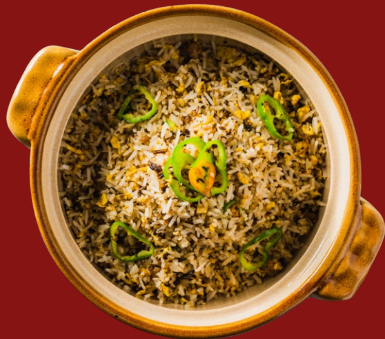
Fried Rice with Yibin Pickle